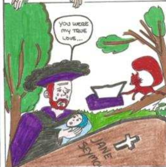
Henry's third wife...