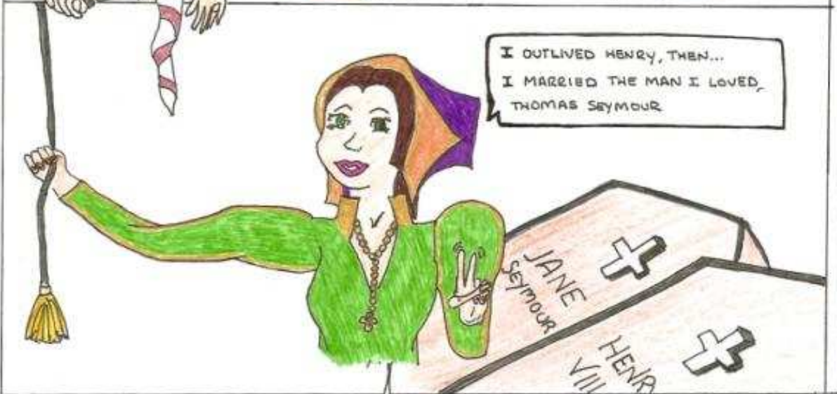
Henry's sixth wife...

I OUTLIVED HENRY, THEN... I MARRIED THE MAN I LOVED, THOMAS SEYMOUR