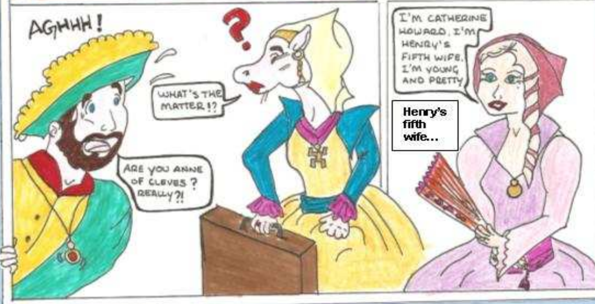
Henry's fourth wife...