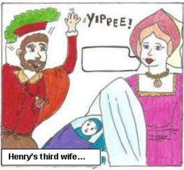
Henry's third wife...