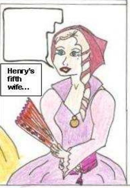
Henry's fifth wife...